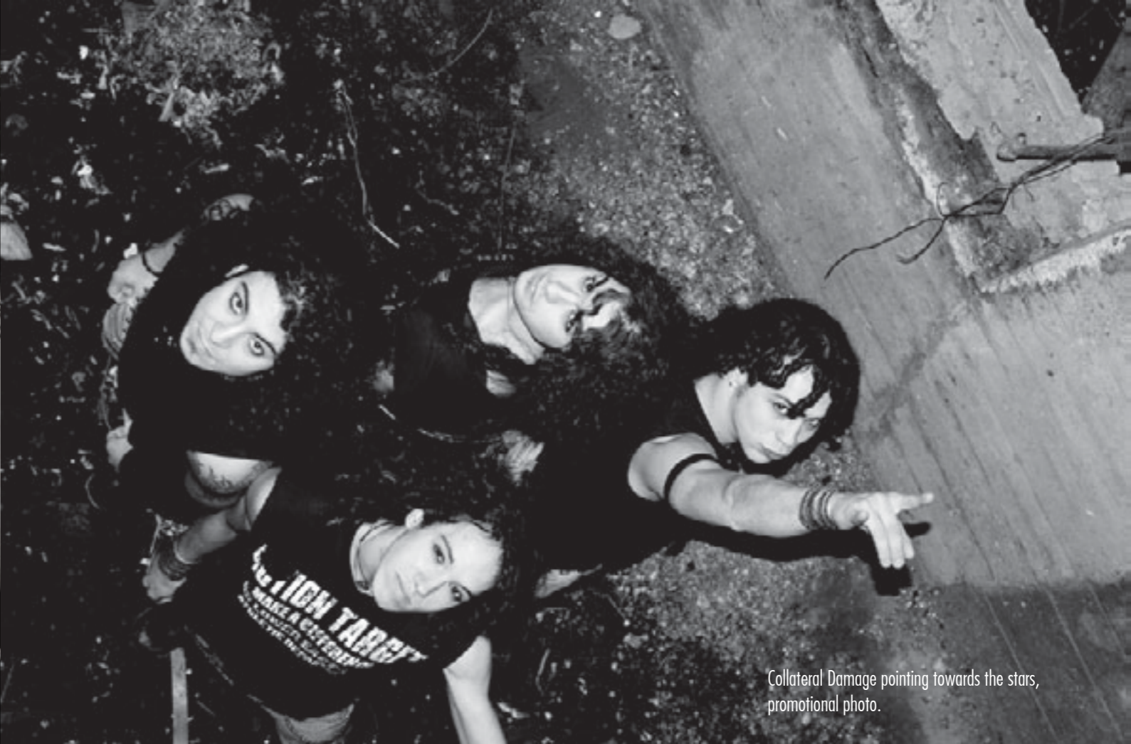
Collateral Damage pointing towards the stars, promotional photo.

WRITTEN BY DANIEL KÄLLMALM PUBLISHED ON 2013-08-26