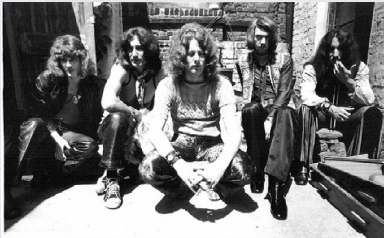
THE HOW IT ALL BEGINS