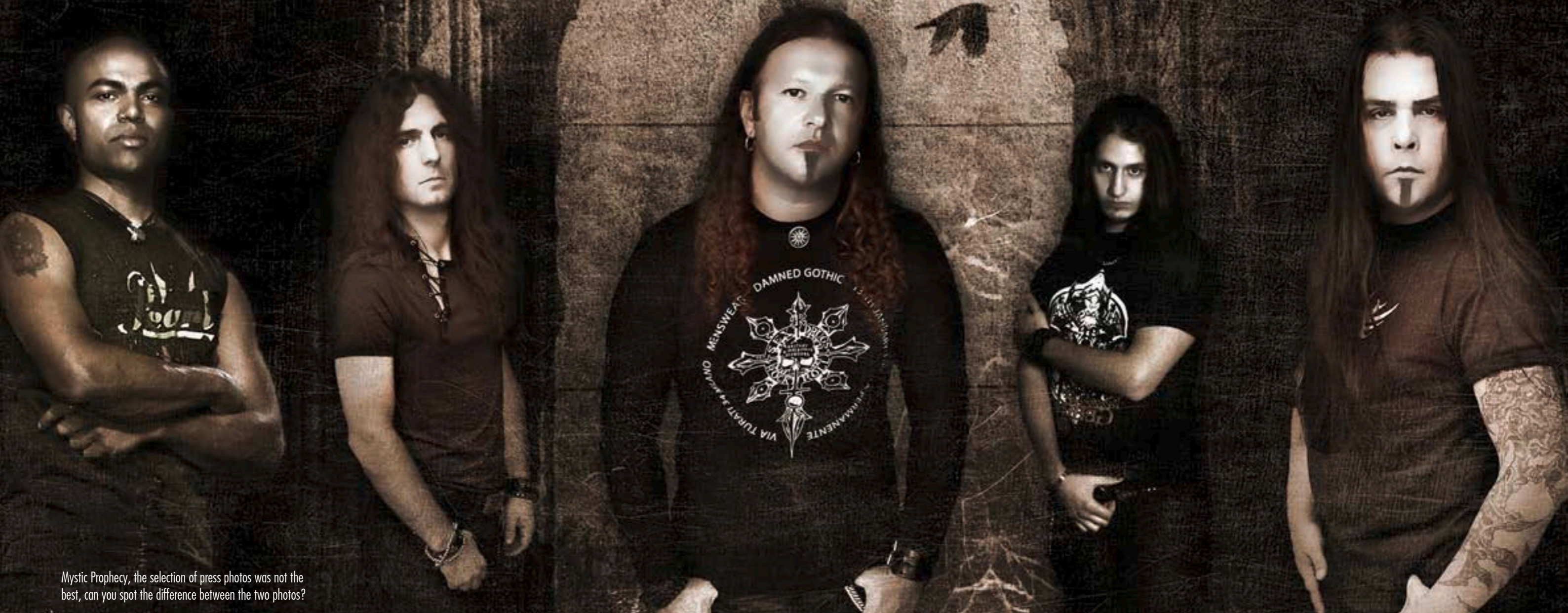
Mystic Prophecy, the selection of press photos was not the best, can you spot the difference between the two photos?

We have so far about 45 reviews, which are all 9-out-of-10, and in the magazines soundchecks we are constantly in the top 5.