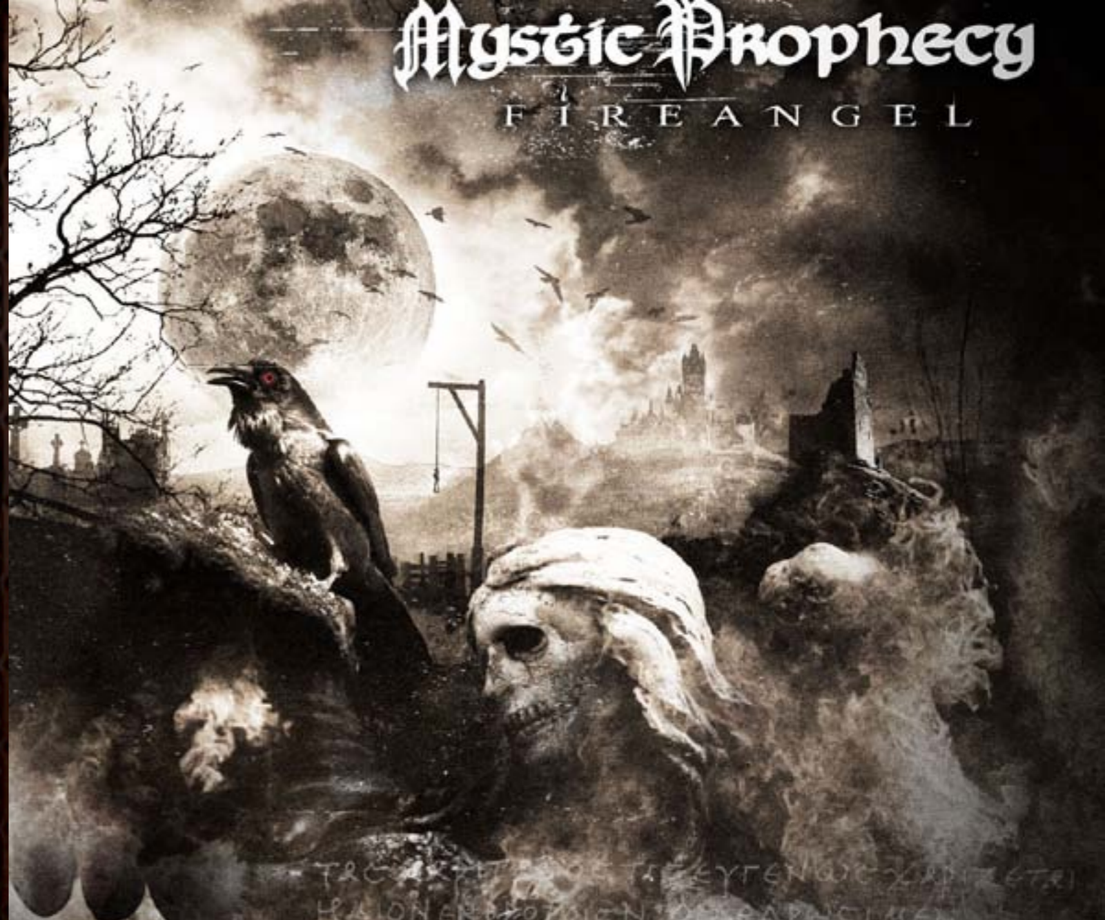
Comparing Ravenlord and fireangel album cover artworks