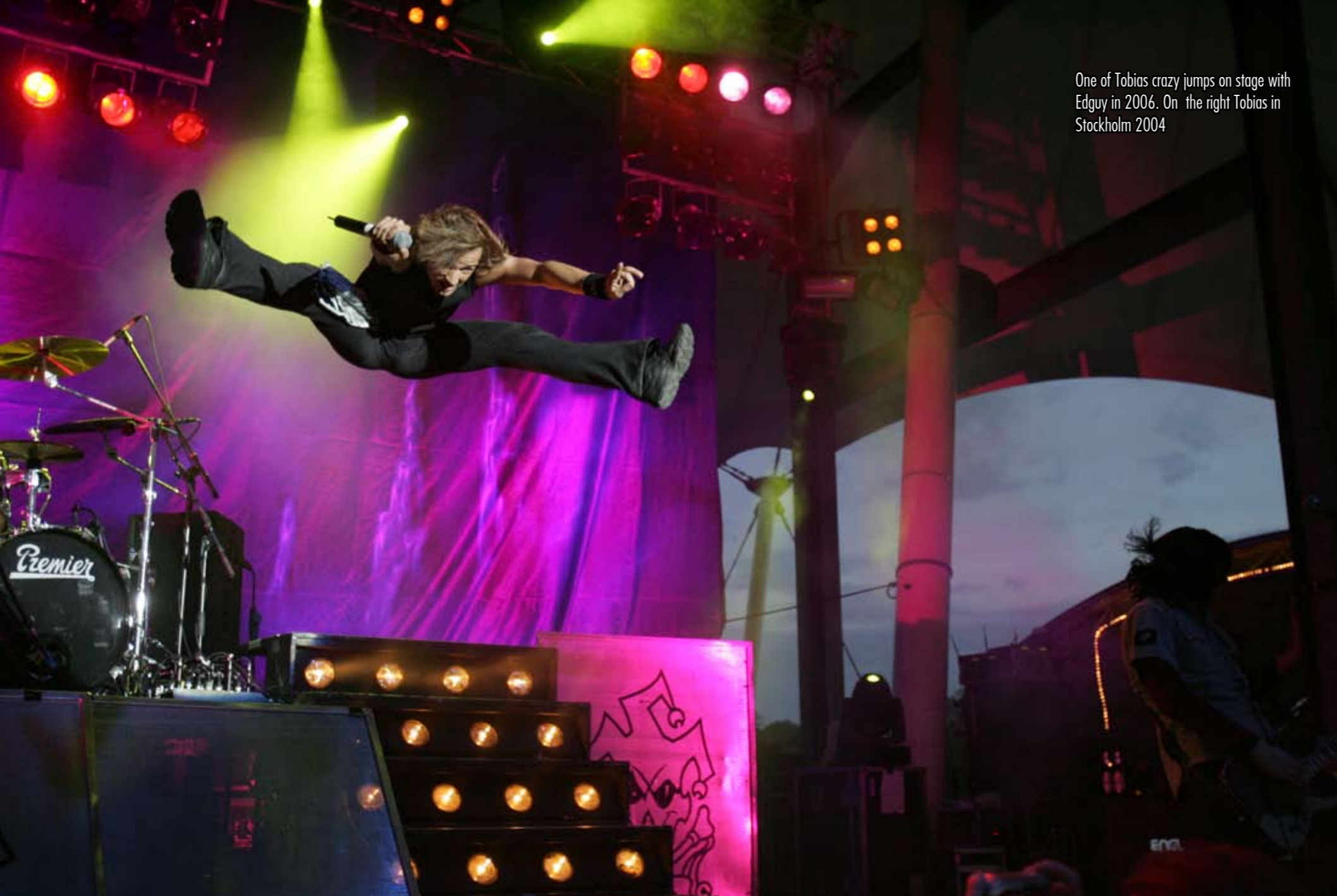
One of Tobias crazy jumps on stage with Edguy in 2006. On the right Tobias in Stockholm 2004