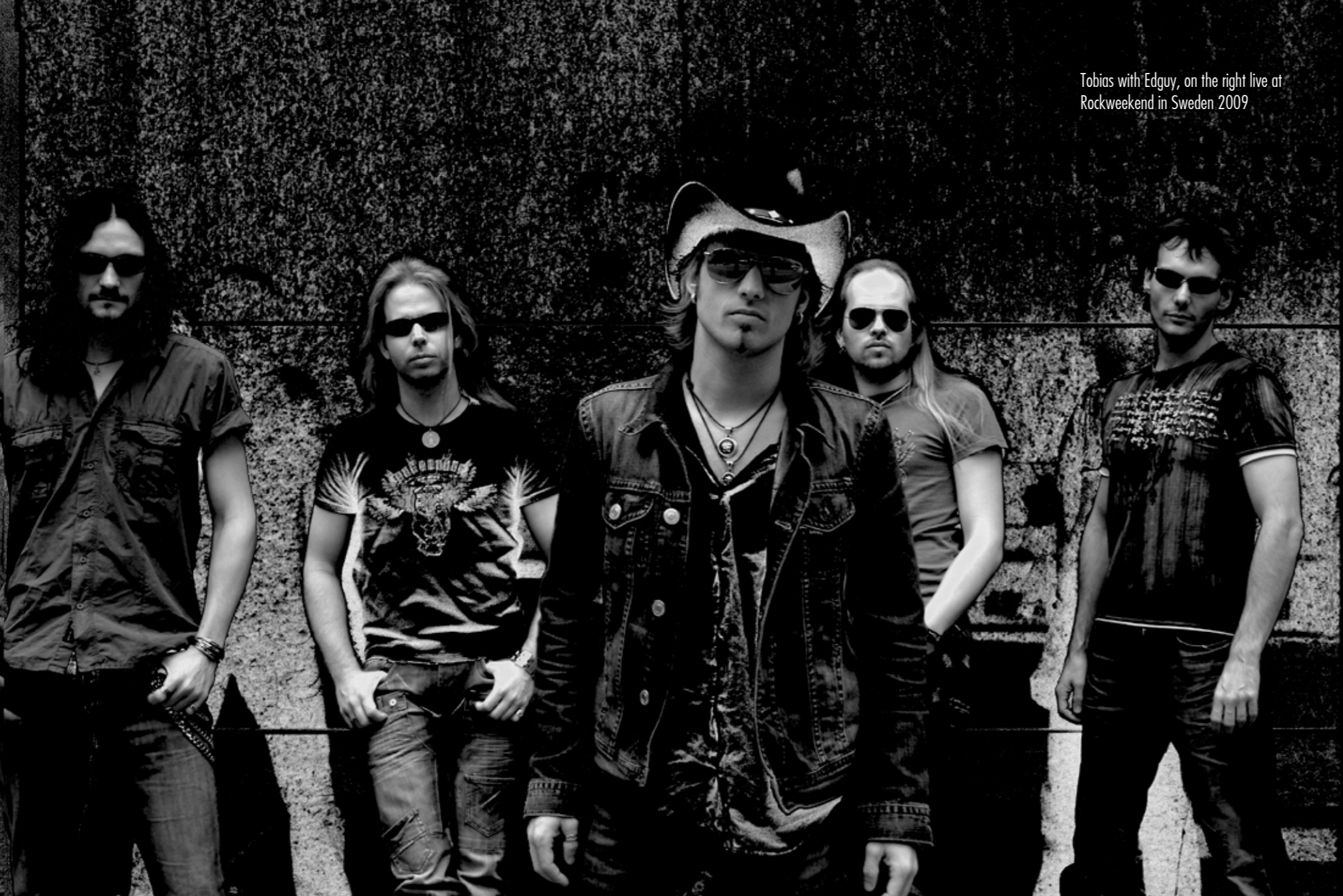
Tobias with Edguy, on the right live at Rockweekend in Sweden 2009